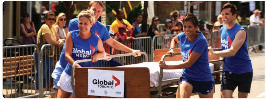
The Global News team competes for the coveted Golden Bed Pan at the 10th Annual Danforth Dash Bed Race